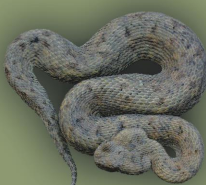
Plain Mountain Adder